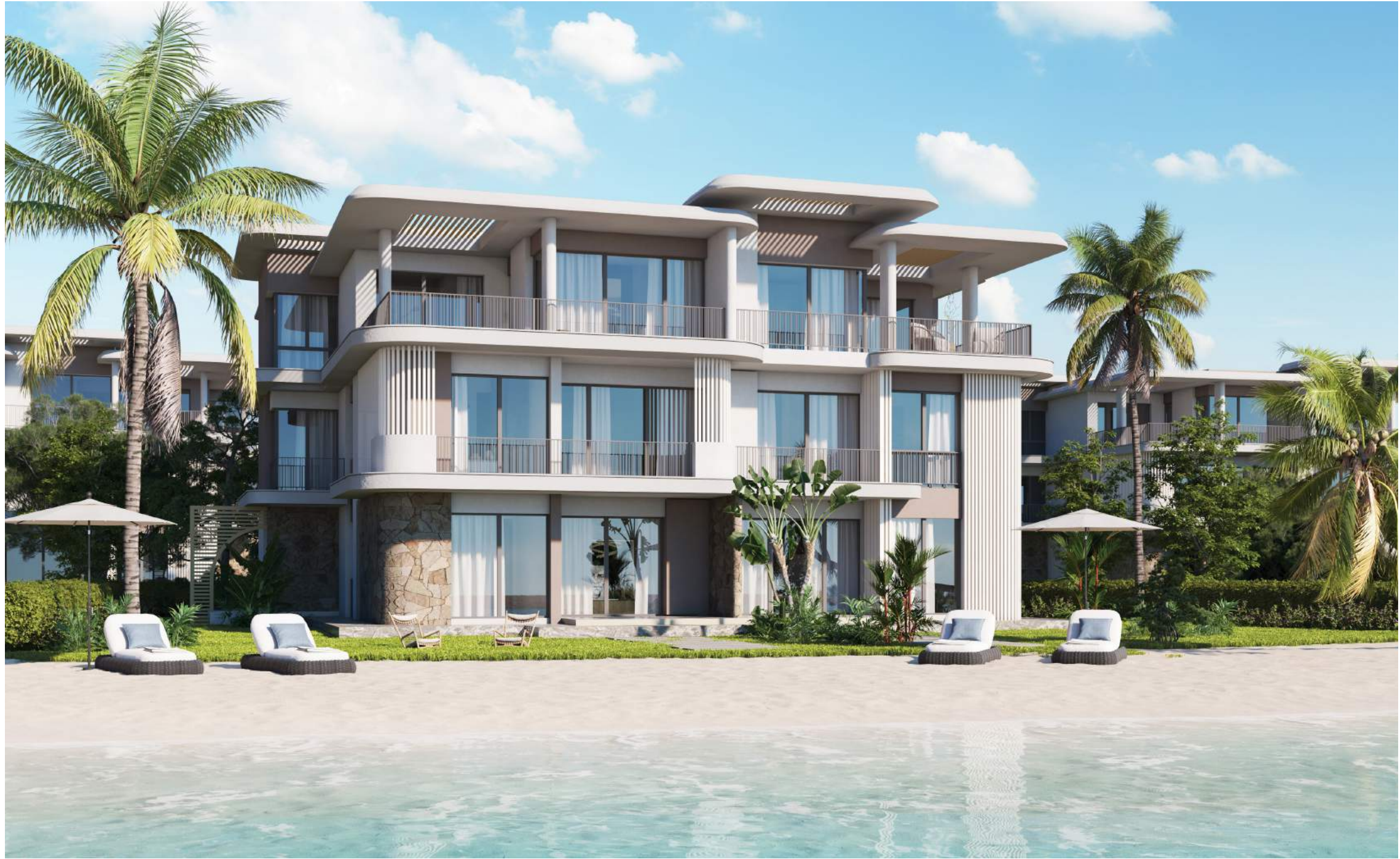
TYPE A - G+2 LAGOON SIDE CONDOS AND PENTHOUSES